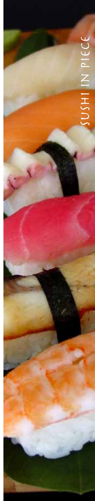
SUSHI IN PIECE

Brochettes marinated in Teriyaki Sauce Chicken ..... $7.90 Steak..... $8.90 Shrimp..... $9.90 Mixed ..... $8.90